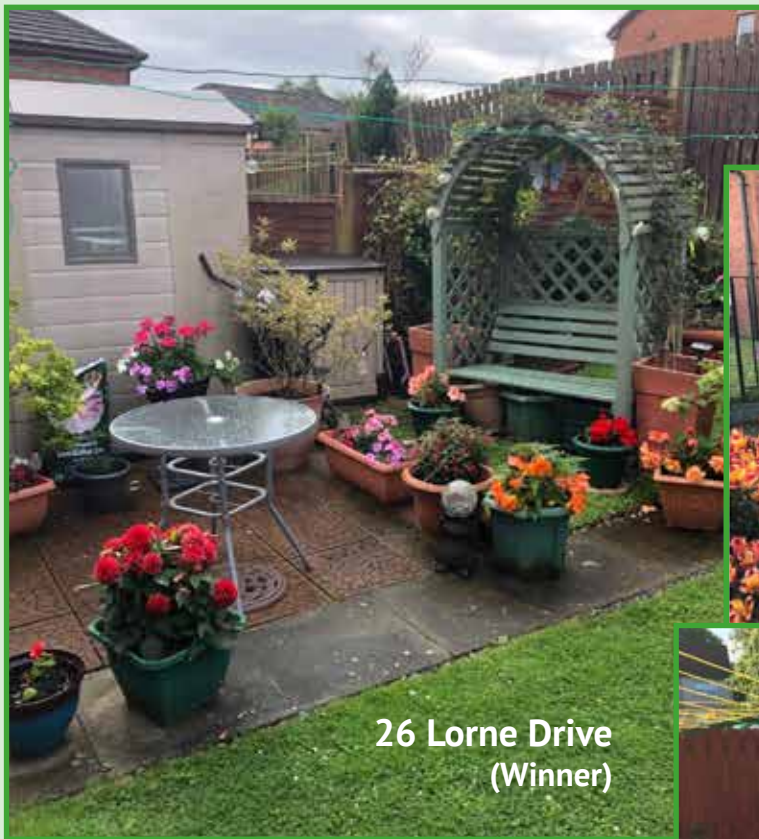
26 Lorne Drive (Winner)

Garden Competition winners revealed – Congratulation & Well Done!!