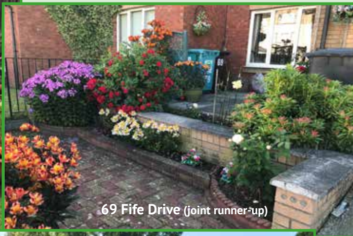
69 Fife Drive (joint runner-up)