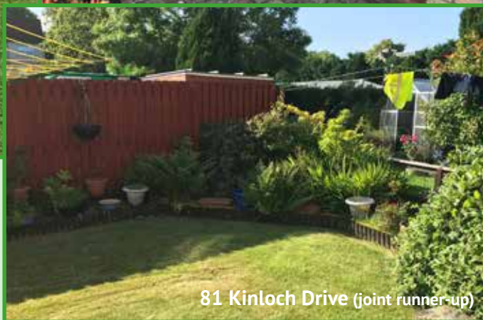
81 Kinloch Drive (joint runner-up)